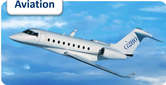
Gulfstream 280 (IAI)