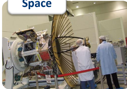
Tecsar Radar Satellite (Elta)