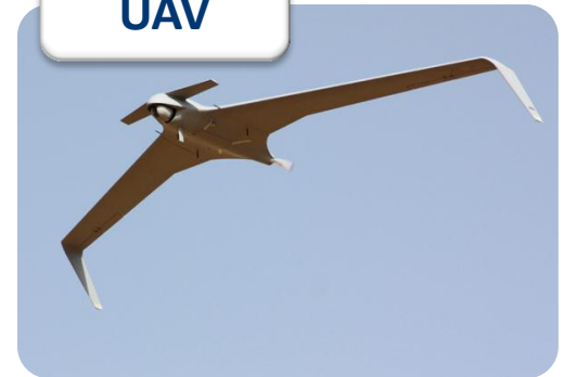
Orbiter 3 (Aeronautics)