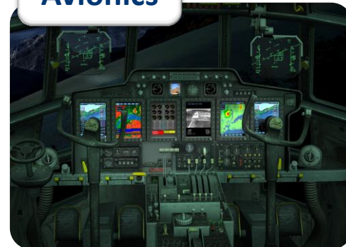
C130 Cockpit (Elbit Systems)