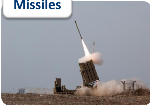
Iron Dome (Rafael)